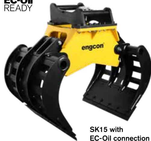
SK15 with EC-Oil connection