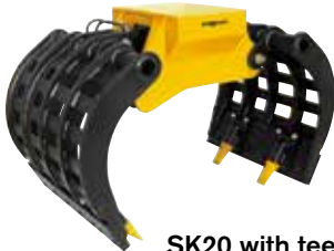
SK20 with teeth (accessory)