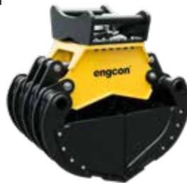
SK20 with closed sides (accessory)